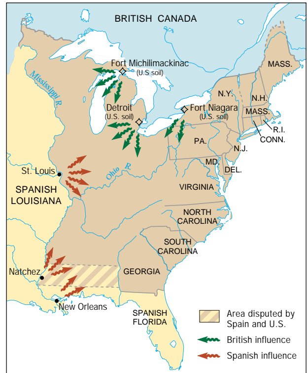
Main Centers of Spanish and British Influence After 1783 This map shows graphically that the United States in 1783 achieved complete independence in name only, particularly in the area west of the Appalachian Mountains. Not until twenty years had passed did the new Republic, with the purchase of Louisiana from France in 1803, eliminate foreign influence from the area east of the Mississippi River.

Spain, though recently an enemy of Britain, was openly unfriendly to the new Republic. It controlled the mouth of the all-important Mississippi, down