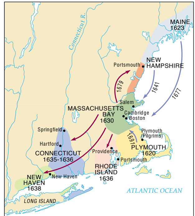
Seventeenth-Century New England Settlements The Massachusetts Bay Colony was the hub of New England. All earlier colonies grew into it; all later colonies grew out of it.