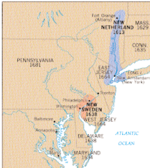
Early Settlements in the Middle Colonies, with Founding Dates

Andros was prompt to use the mailed fist. He ruthlessly curbed the cherished town meetings; laid heavy restrictions on the courts, the press, and the schools; and revoked all land titles. Dispensing with the popular assemblies, he taxed the people without the consent of their duly elected representatives. He also strove to enforce the unpopular Navigation Laws and suppress smuggling. Liberty-loving colonists, accustomed to unusual privileges during long decades of neglect, were goaded to the verge of revolt.